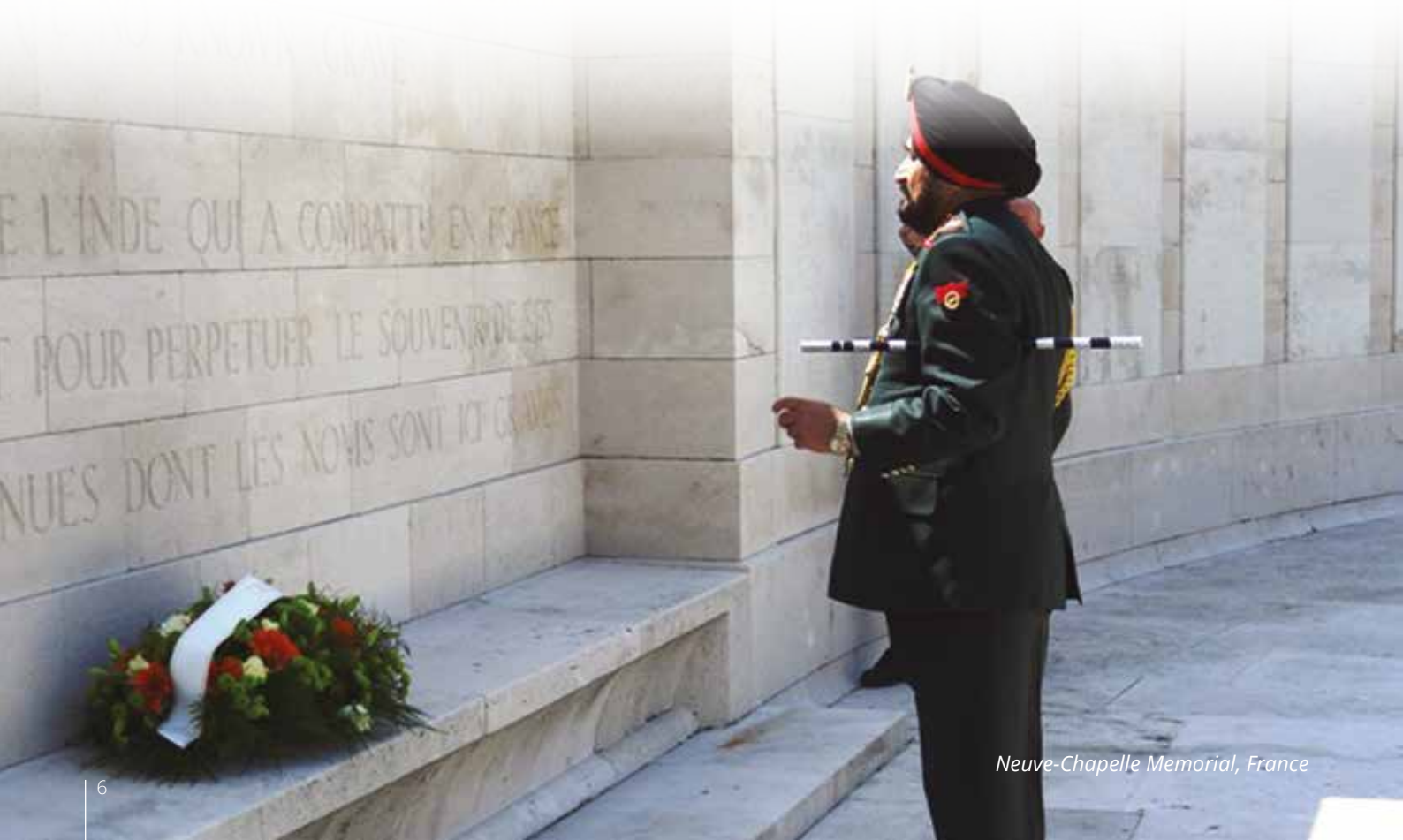
Neuve-Chapelle Memorial, France

Our Purpose, Mission, and Values are not just words – rather they are a commitment, a promise to those we care for, to those we serve, and to those who make that mission possible. They underpin everything we do, everything we are, everything we say, and everything we hold sacred.