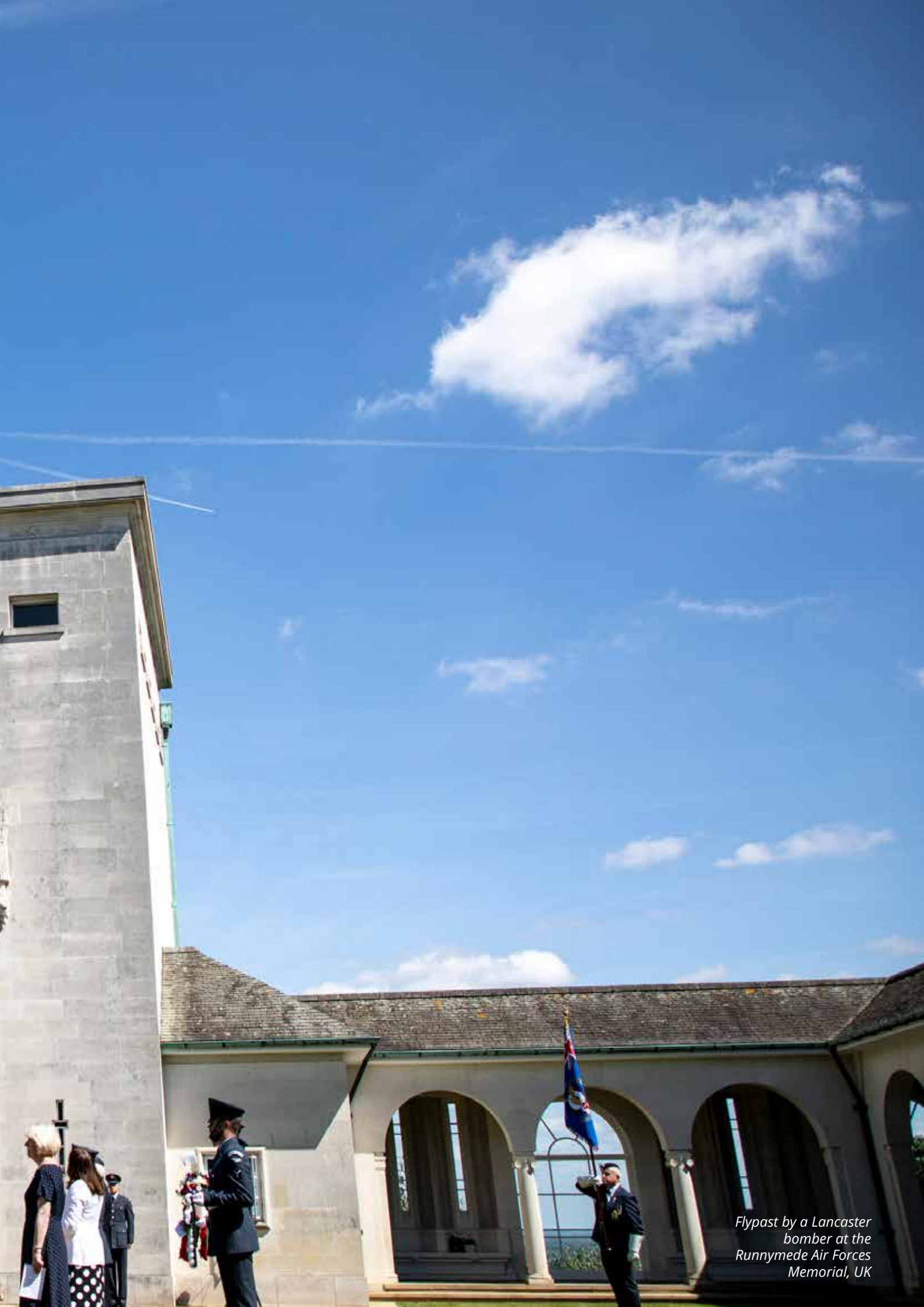
Flypast by a Lancaster bomber at the Runnymede Air Forces Memorial, UK