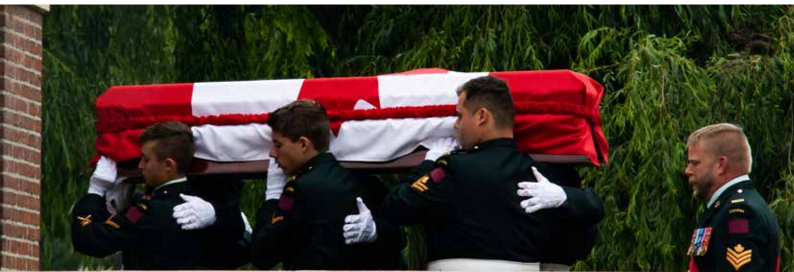
Canadian reburial at New Irish Farm Cemetery, Belgium

OUR GOAL IS TO IDENTIFY AND APPROPRIATELY COMMEMORATE ALL THOSE ELIGIBLE WAR DEAD NOT PREVIOUSLY COMMEMORATED BY CWGC OR NOT COMMEMORATED EQUALLY AND, MORE WIDELY, TO RAISE AWARENESS OF THE CONTRIBUTION THEY MADE DURING TWO WORLD WARS.