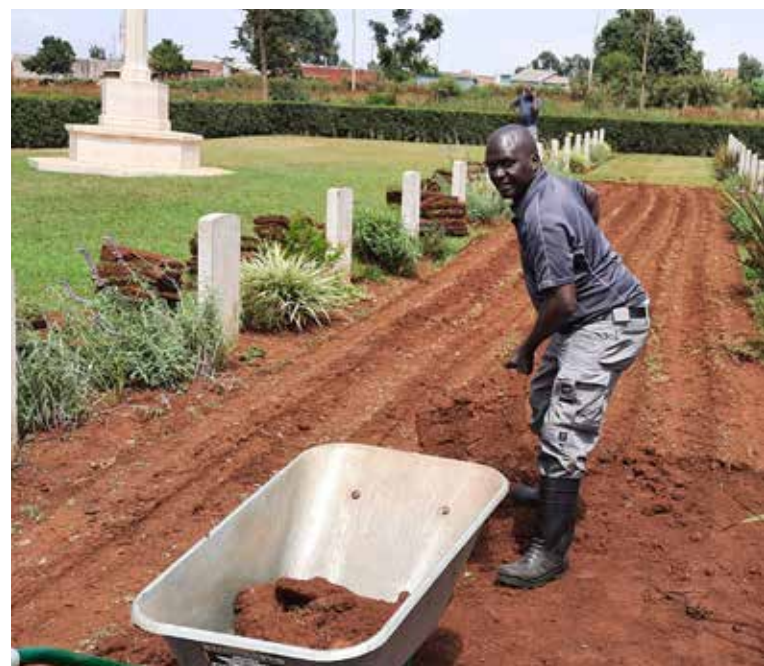
Returfing at Kitale War Cemetery, Kenya

As guardians and custodians of this great institution, it is incumbent on us all, in our various roles, to care for each other and our Mission, and to lead by example. We work with confidence, positivity, and trust, and strive each day to leave things a little better than we found them.