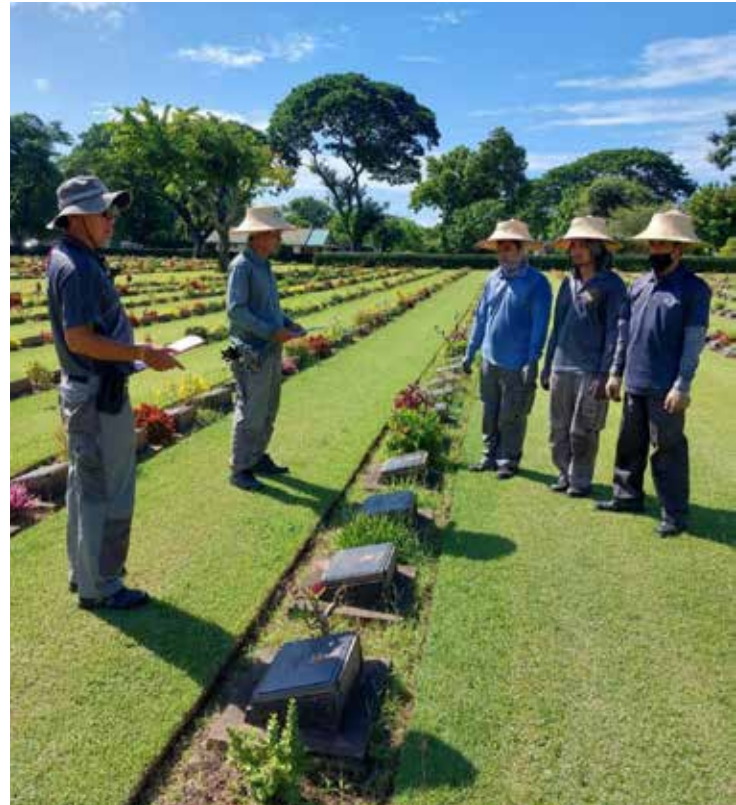
Training at Kanchanaburi War Cemetery, Thailand

OUR GOAL IS THAT WE WILL SUCCEED BY PUTTING OUR PEOPLE FIRST, AT THE HEART OF OUR ORGANISATION, ATTRACTING, DEVELOPING AND RETAINING TALENTED, MOTIVATED TEAMS. OUR STAFF, OUR VOLUNTEERS, AND OUR CONTRACTORS WILL BE PART OF A JUST, INNOVATIVE, AND INCLUSIVE CULTURE THAT HELPS PEOPLE TO BE THE BEST THEY CAN BE.