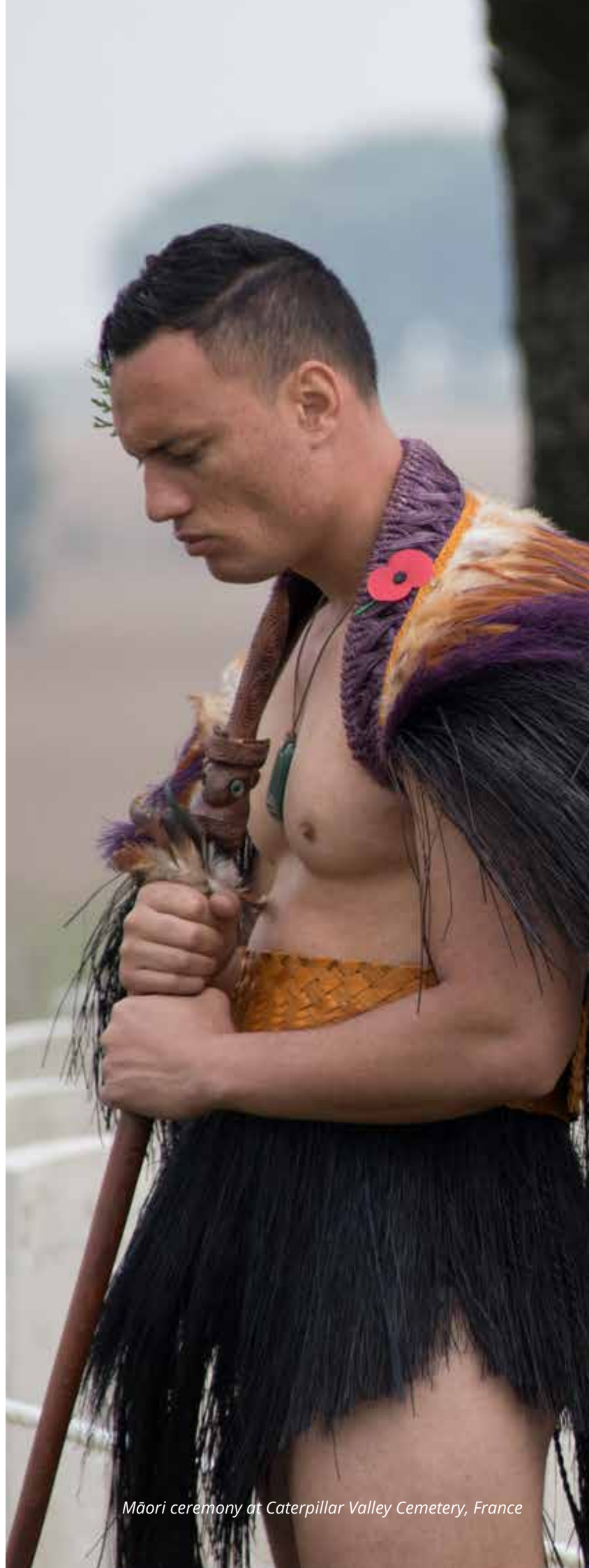
Māori ceremony at Caterpillar Valley Cemetery, France

OUR GOAL IS TO HAVE DEVELOPED THE HIGH-LEVEL GLOBAL RELATIONSHIPS NECESSARY TO BE VALUED AS AN INSTRUMENT FOR DIPLOMACY AND INFLUENCE, AND TO HAVE CONSOLIDATED OUR LEADERSHIP POSITION WITHIN THE GLOBAL COMMEMORATIVE LANDSCAPE.