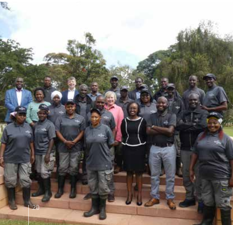
The Director General with our team in Nairobi, Kenya

OUR GOAL IS TO HAVE A COMPREHENSIVE, FULLY FUNCTIONING GOVERNANCE, COMPLIANCE, AND ASSURANCE FRAMEWORK THAT INTEGRATES ENVIRONMENTAL SOCIAL AND GOVERNANCE (ESG) CONSIDERATIONS AND DELIVERS THIS STRATEGY EFFECTIVELY.