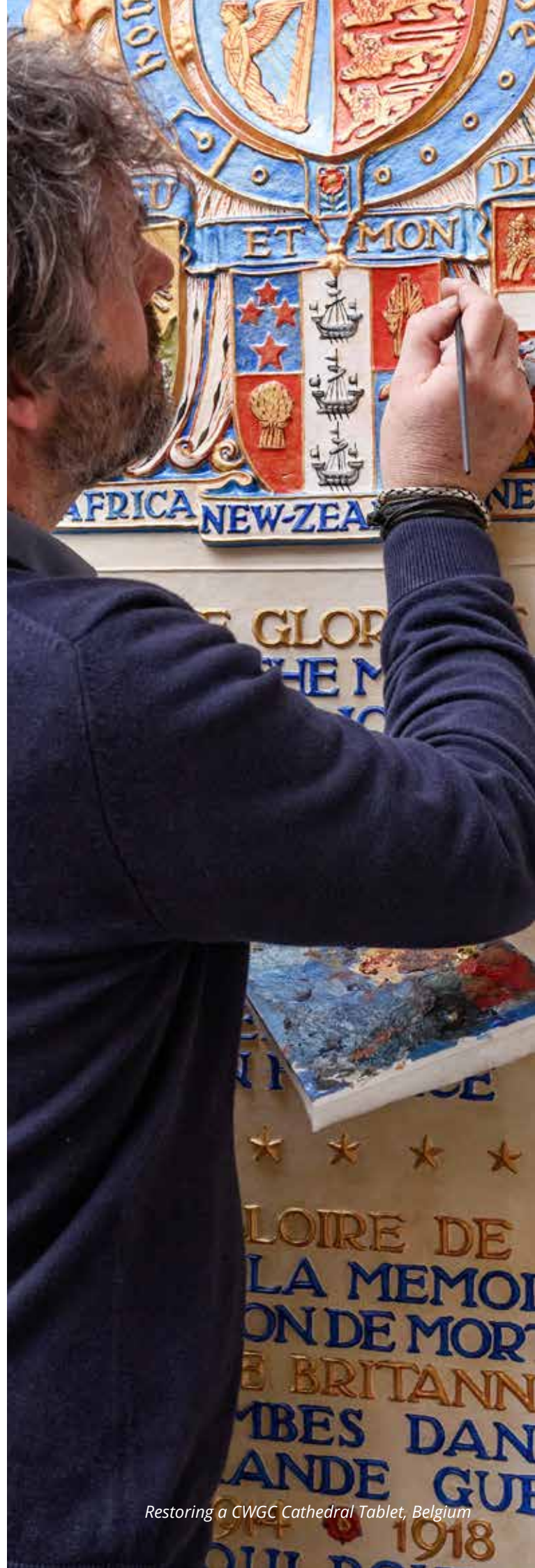
Restoring a CWGC Cathedral Tablet, Belgium

Back cover from left to right: Plymouth Naval Memorial, UK; CWGC Compost Farm at Bedford House Cemetery, Belgium; El Alamein War Cemetery, Egypt