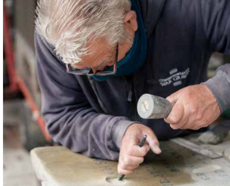
Stone repairs Cliveden War Cemetery, UK

Our Ambition reflects our position of strength, expertise, and knowledge, but also our desire to innovate and explore new opportunities – leveraging the expertise we have for the benefit of a wider audience and ourselves.