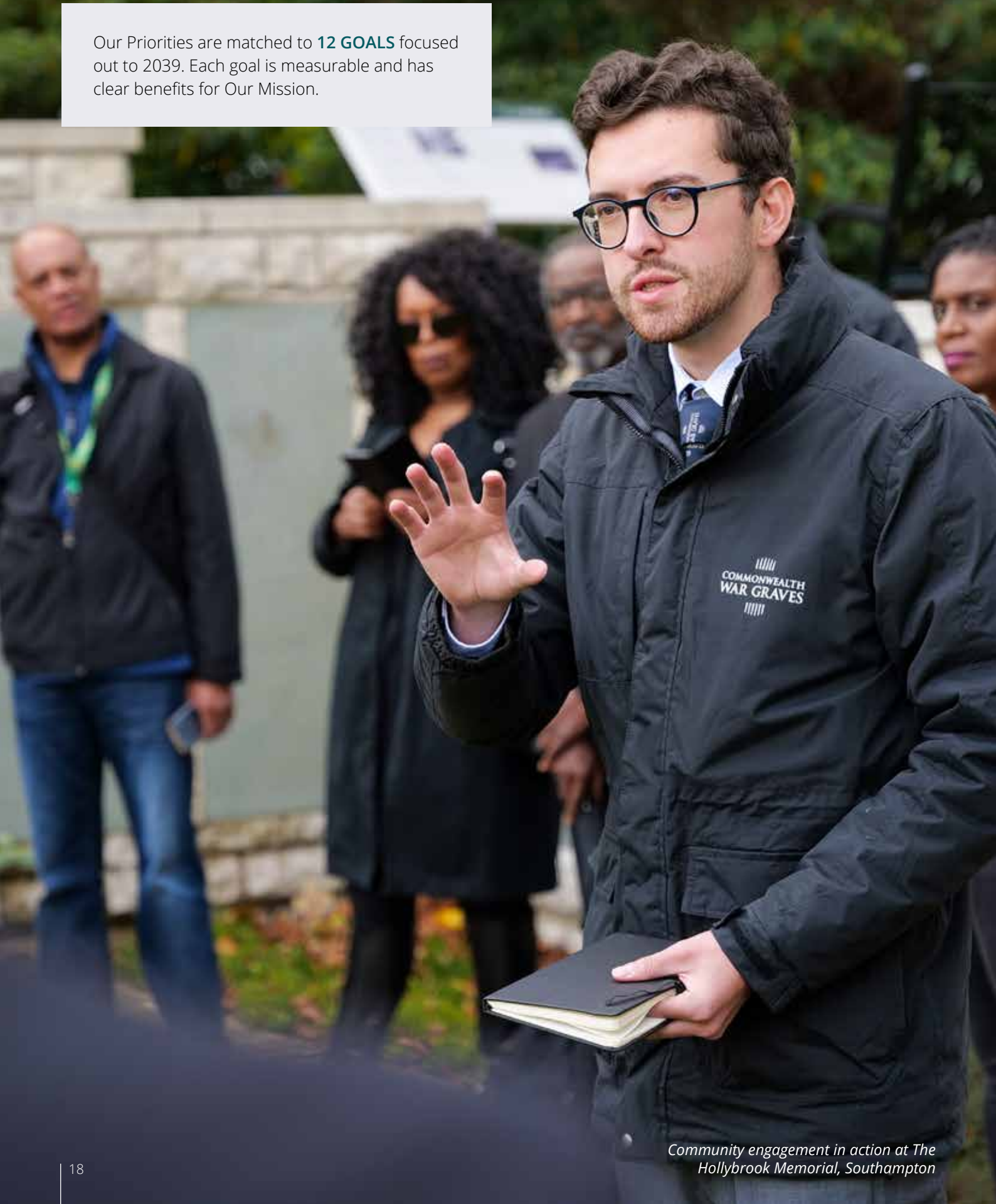
Community engagement in action at The Hollybrook Memorial, Southampton

Our Priorities are matched to 12 GOALS focused out to 2039. Each goal is measurable and has clear benefits for Our Mission.