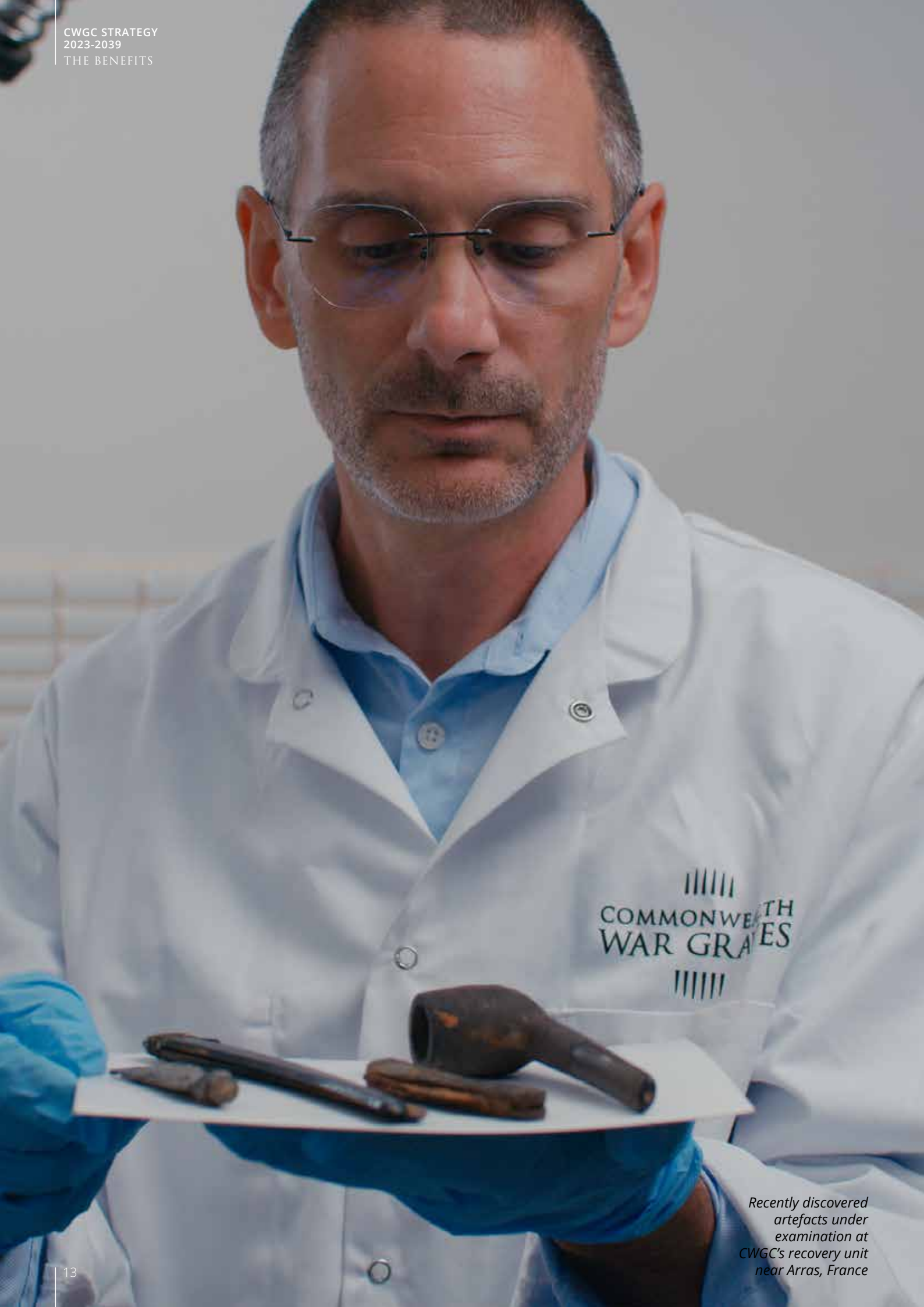
Recently discovered artefacts under examination at CWGC's recovery unit near Arras, France