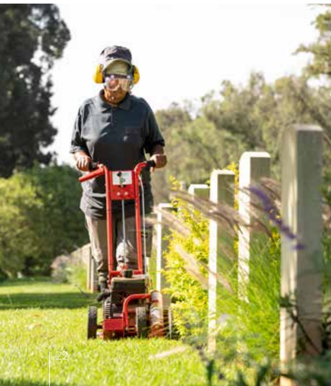
Nairobi War Cemetery, Kenya

OUR GOAL FOR HORTICULTURE IS TO DESIGN AND DELIVER ENVIRONMENTALLY SUSTAINABLE, COST-EFFECTIVE, BIODIVERSE, AND LOCATION APPROPRIATE WORLD CLASS HORTICULTURE THAT DELIGHTS, INSPIRES, INFORMS AND ATTRACTS EVER MORE DIVERSE VISITORS OF CURRENT AND FUTURE GENERATIONS FROM ACROSS THE GLOBE.