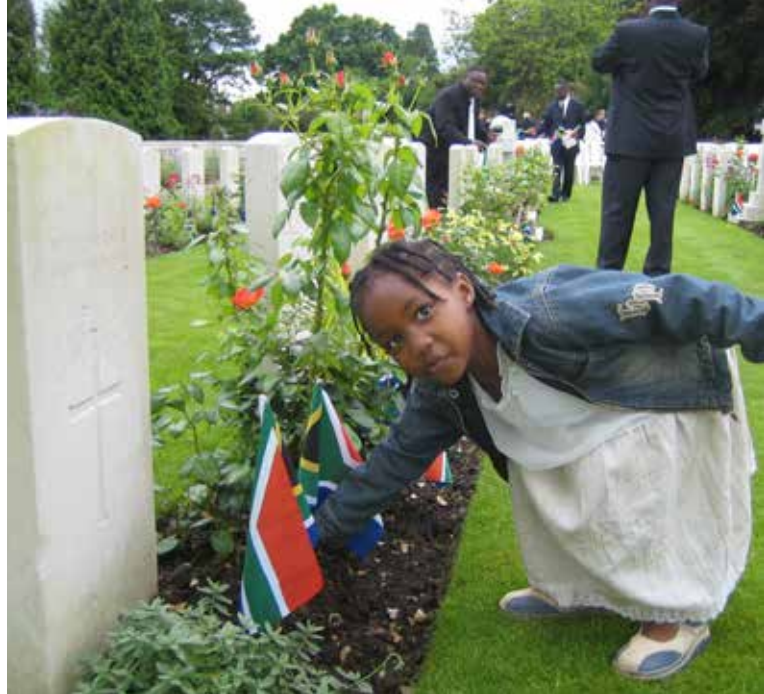
SS Mendi commemoration at Southampton (Hollybrook) Cemetery, UK

OUR GOAL IS TO MAINTAIN AND ENHANCE FULLY DIGITISED, INTEGRATED & ACCESSIBLE CASUALTY & ARCHIVE RECORDS TO ENABLE EFFECTIVE COMMEMORATION OF THE FALLEN IN PERPETUITY, AND WORK WITH PARTNERS TO DELIVER AN EXPERT, PROFESSIONAL, AND COMPLIANT SERVICE IN SUPPORT OF THE DISCOVERY, RECOVERY, IDENTIFICATION, REBURIAL, AND COMMEMORATION OF WAR CASUALTIES, AND ENGAGE AN EVER-WIDER AUDIENCE WITH CWGC.