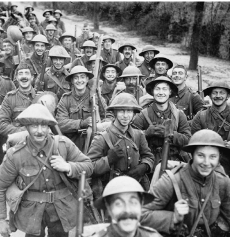
10th Battalion, Royal Fusiliers (37th Division) marching to the trenches at Arras, November 1916

Our Mission has great and enduring meaning; each one of those we commemorate was a person like us, with their own ambitions, hopes, and dreams. Theirs are the broad shoulders on which we stand and, by reference to them, we regard all that we achieve, and all that we strive to achieve, as our privilege.