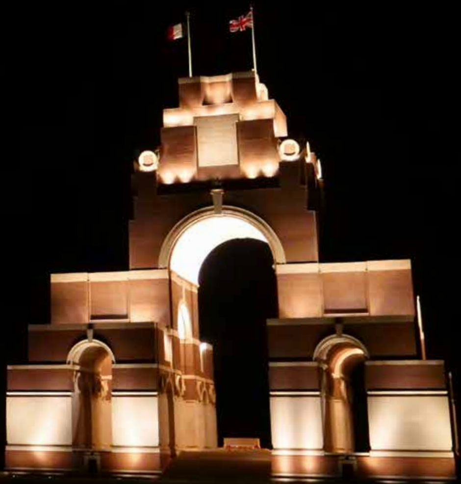
The Thiepval Memorial to the Missing, France