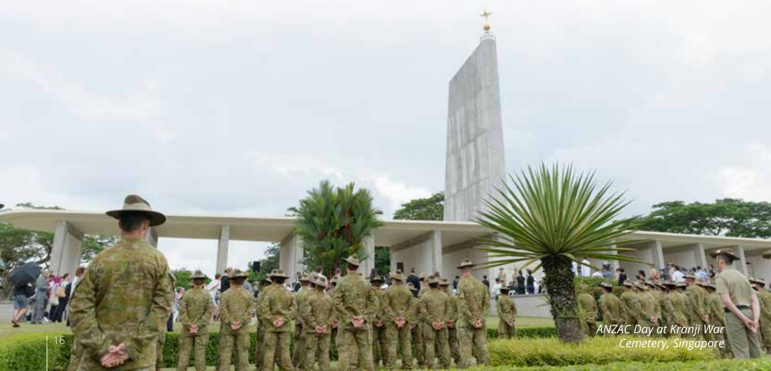
ANZAC Day at Kranji War Cemetery, Singapore

Successful delivery will ensure we achieve our ambition as a global leader in Commemoration for all time.