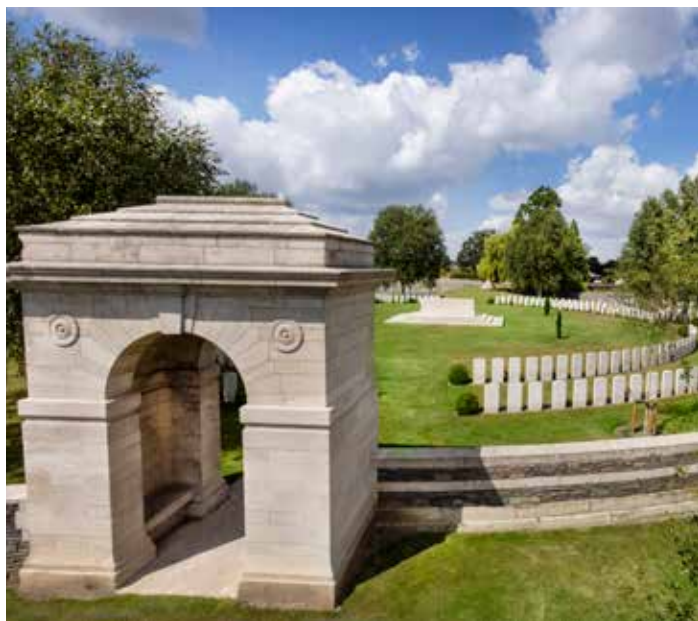
Railway Dugouts Burial Ground (Transport Farm), Belgium

OUR GOAL, IN LINE WITH THE BEST CONSERVATION PRACTICE, IS TO COST-EFFECTIVELY, SAFELY, AND SUSTAINABLY MANAGE OUR COMMEMORATIVE ESTATE (STRUCTURES) IN PERPETUITY TO A STANDARD OF EXCELLENCE TO ENSURE THE LAST PHYSICAL REMINDERS OF THE HUMAN COST OF THE WORLD WARS ARE VALUED AND ATTRACT EVER MORE DIVERSE VISITORS FROM NEW GENERATIONS FROM ACROSS THE GLOBE.